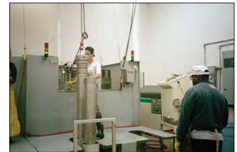
Fig. 6 Stainless steel cylinders hold oysters for the pressurization process.