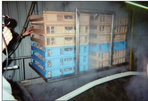
Fig. 4 Cartload of oysters is immediately cooled down to 40 degrees Fahrenheit for 15 minutes.