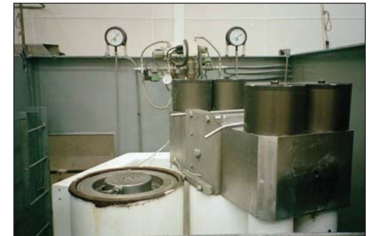
Fig. 5 Titanium-made isolators used in the HHP processing of oysters.

This is a patented process of treating harvested oysters using high pressures of 35,000 to 40,000 (psi) (Figure 5 and 6). Oysters undergo pressurization for 3-5 minutes in order to kill spoilage bacteria and decrease other microorganisms including Vibrio bacteria to non-detectable levels. This process can be adapted for both the half shell and the shucked meat of the oyster. The pressure helps in releasing the adductor muscle from the shell, making it easy to remove the oyster from the shell.