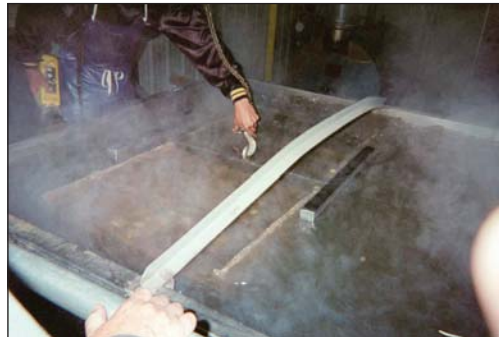
Fig. 3 Cartload of oyster trays dipped in hot water bath for 24 minutes.

Pasteurization is a patented process using hot and cold-water treatment to lower the levels of Vibrio bacteria to non-detectable levels. In-shell oysters are placed in warm water (126 degrees Fahrenheit) for 24 minutes (Figure 3) and then immediately dipped in cold water (40 degrees Fahrenheit) (Figure 4) to stop the cooking process of the meat. The cold water dipping lasts 15 minutes before the oysters are packed for the half shell market or sent for further processing as shucked meat.