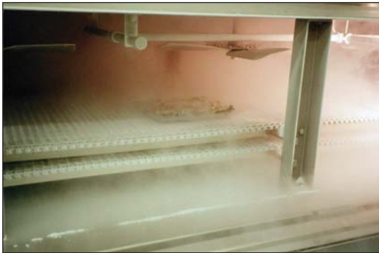
Fig. 1 Half shell oysters on a tray being frozen through the IQF machine tunnel.

Freezing oysters to increase storage life has long been practiced by the industry (Figures 1 and 2). Borrowed from other sectors of the food industry, the IQF method of processing oysters certainly has its own niche in the market. Aside from the resulting decrease of microorganisms including Vibrio bacteria to non-detectable levels, extended shelf life is a major selling point of the process.